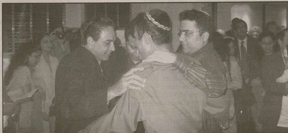
Indian Jews dancing during the Simchat Torah festival.