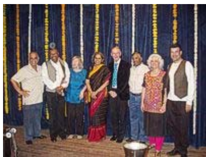
Rivers of Babylon after a concert at Patkar Hall in Mumbai

Most of the group members have known each other since childhood and were born into the Baghdadian Jewish community in India (Mumbai and Calcutta), thus representing a cultural tradition which was transported from Iraq to India and now to the U.K. The group includes ethnomusicologists, an expert on the Chinese erhu (spike fiddle), architects, a writer, accountant, secretary and fire prevention officer.